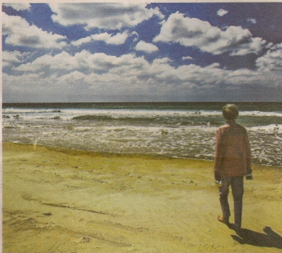
Special to Coastal Life

superficial spider veins with sclerotherapy by injecting a solution to collapse the veins. Now Conrad is going on walks and bicycle rides.